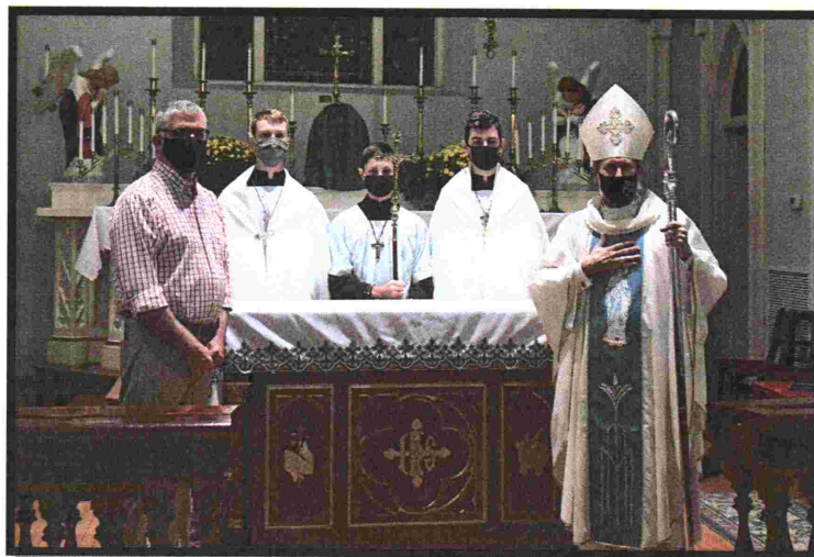
New Altar for Saint Joseph Parish

St. Joseph church has a new permanent altar installed in the sanctuary. The altar is constructed in the Gothic Revival style so that it coordinates with the original furnishings of the church. In accordance with canon law, the new altar has a mesa (tabletop) of solid natural stone - the same stone that has been used on the cupboards in the vestibule. The altar table itself is constructed of wood stained and painted to match the colors of the original side altars with details picked out in gold leaf paint. The complete altar weighs more than 500 pounds.